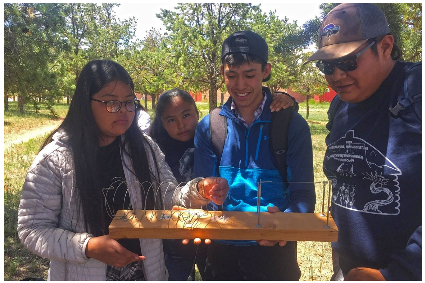
Native American-Serving Institutions Internship Program