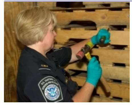
Lacey Act Phase VII Requirements