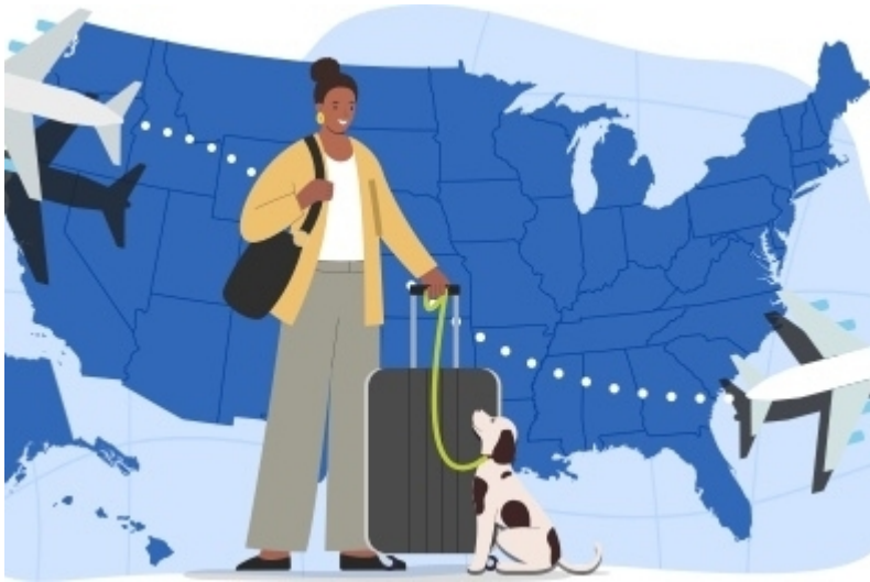
Bring a Pet From Another Country into the United States (Import)