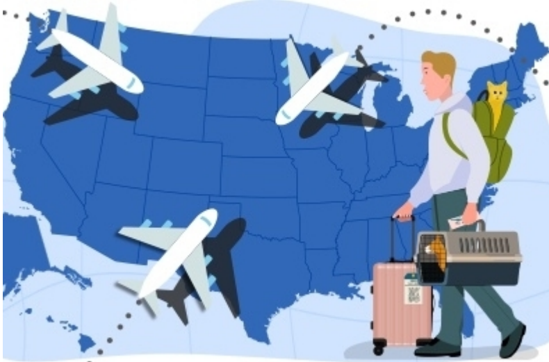
Take a Pet From One U.S. State or Territory to Another (Interstate)