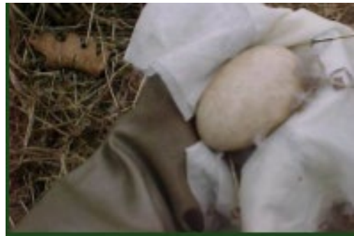
Figure 2. Oiling eggs with a cloth soaked in oil.