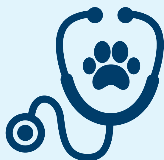
Veterinarian (0701 series)