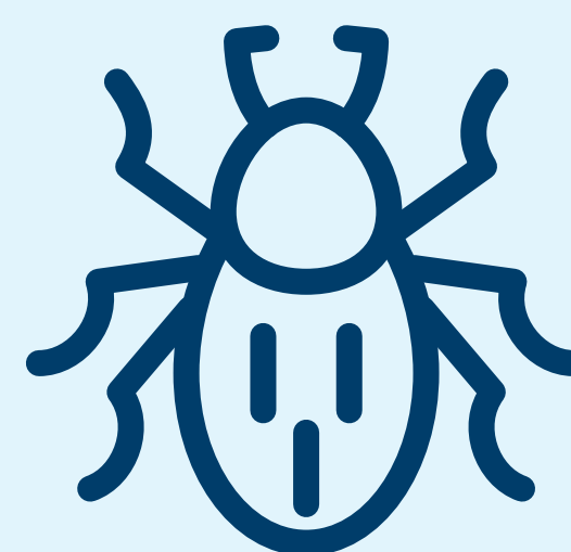
Entomologist (0414 series)