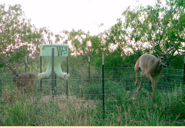
Deer at an ivermectin corn feeder.

Commonly called cattle fever, babesiosis causes cattle to lose weight, produce less milk, and even die. The disease caused enormous losses to the cattle industry in the past. Before the eradication program began, direct and indirect economic losses were estimated to be $130.5 million-more than $3 billion today. USDA and its partners worked together to eradicate the disease from the country by 1943, except for a permanent quarantine area along the Texas/ Mexico border, where the ticks that carry this disease are still found. Mexico continues to find babesiosis, so this buffer zone plays an important role in keeping ticks from spreading the disease back into the United States. USDA works closely with the Texas Animal Health Commission (TAHC) to carry out cattle fever tick eradication efforts. USDA and TAHC rely on research partners for livestock, wildlife, and environmental treatments, and for strategy and planning for future outbreak management. CFTEP research partners outside USDA APHIS and TAHC include the USDA Agricultural Research Service, Texas Agricultural Mechanical University, and Northern Arizona University.